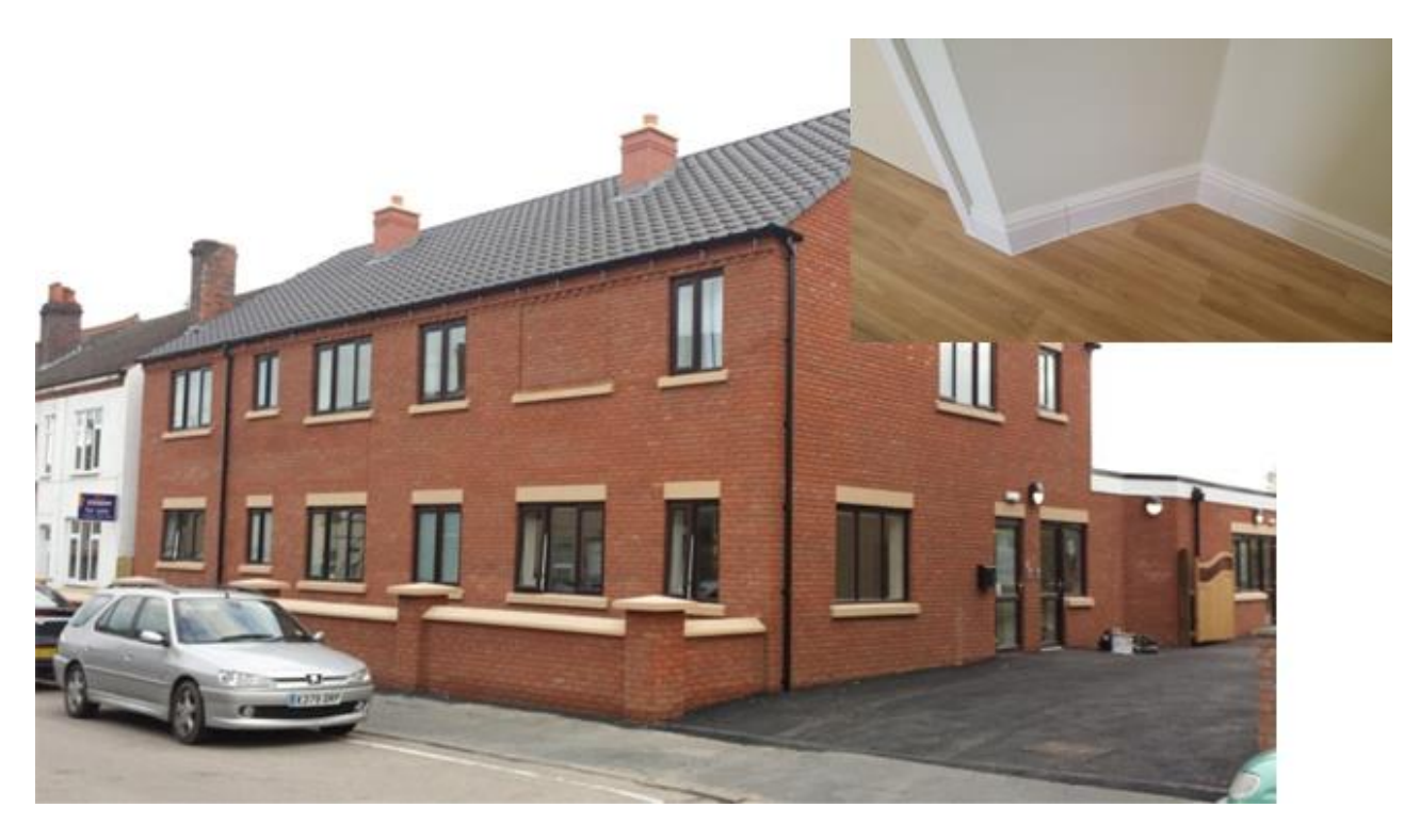
The Noble Care Centre is a purpose built autistic care centre in Nuneaton

Description: 7 bed Autistic Centre ThermaSkirt Profile: Urban LT in Cricket White Clients: Nuneaton Council