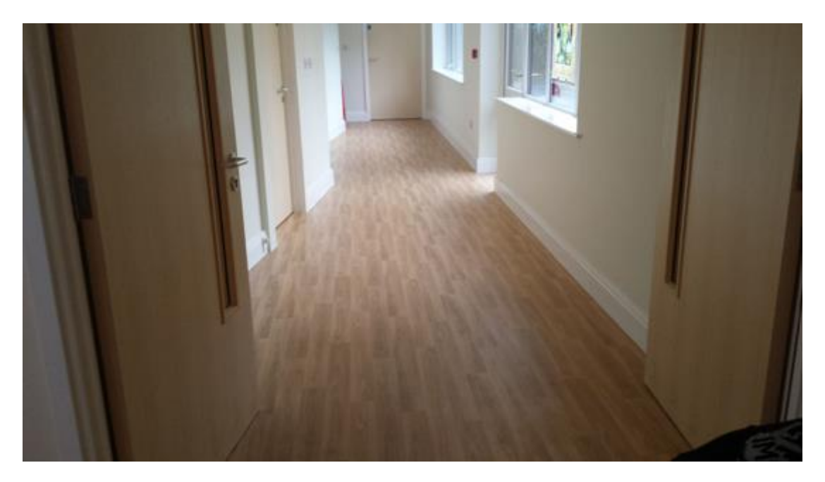
Corridors and gangways are kept clear of radiators by using ThermaSkirt throughout.

The architects ruled out under floor heating due to previous experience of the system in similar care establishments found that it encouraged the residents to lie on the floor rather than participate in the therapeutic activities that they are there to benefit from.